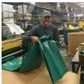
200 cases of "PGA Green" liners roll off the production line to meet the deadline.

By noon, the immediately needed 40 cases of "PGA green" plastic liners were loaded into the customer's truck and on their way to the tournament, arriving with an hour to spare before the 5 p.m. deadline. The balance of the order was shipped out later that day for use in the customer's future events.