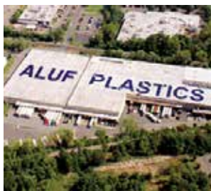
Aluf's 500,000 square foot production facility has impressive capacity and agility.